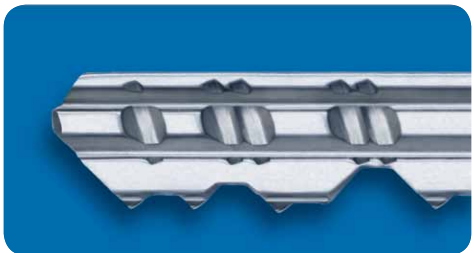
DPS-longitudinal profile for high security of the key