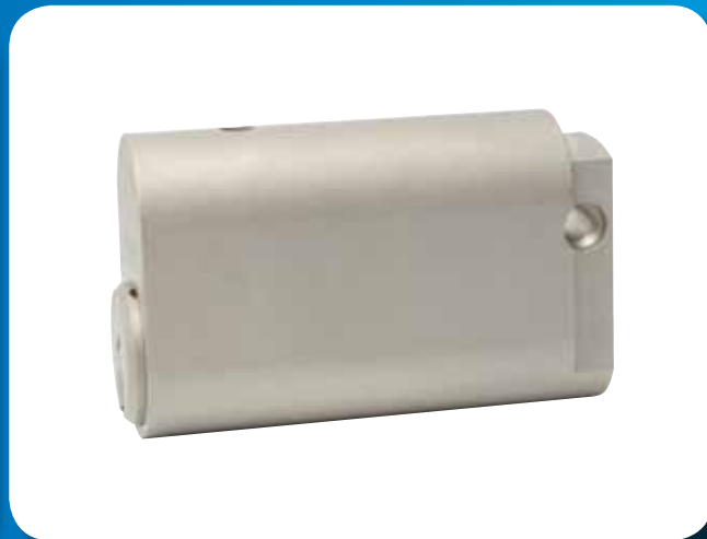
RIM DEADLATCH/DEADLOCK CYLINDERS